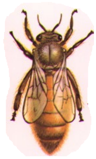
I am the Biggest bee in the Hive!

The drones are male bees. Their only job is to mate with the queen. Worker bees even bring them their meals.