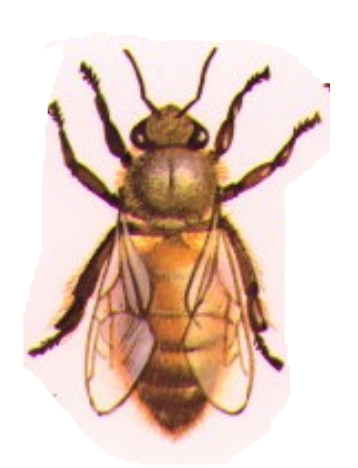
I look after everyone else!

The worker bees basically do all of the work. They collect nectar, make honey, royal jelly and bee bread, make cells, clean the hive, protect the hive and care for the drones